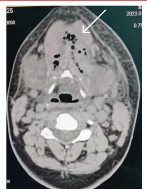
Figure 4. Axial CT showing air foci denoting gas forming organism involving the anterior visceral space (arrow).