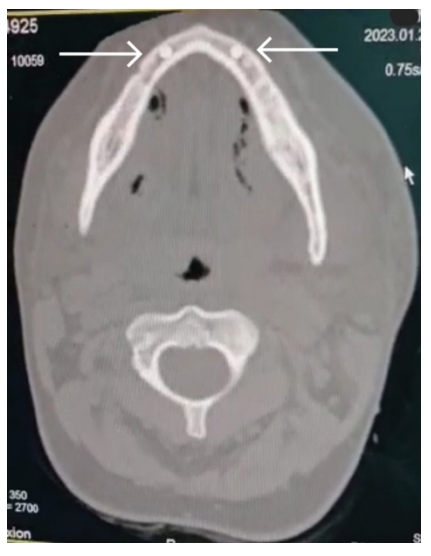
Figure 2. Axial CT showing the recent (left) and old (right) canine mandibular implants (arrows).

On examination, the patient was feverish. She had hoarseness and respiratory distress. The neck swelling was tense, tender with erythematous overlying skin involving the submental, bilateral submandibular regions down to the level of the thyroid cartilage (Figure 1). Oropharyngeal exam showed evidence of trismus, sublingual edema and pus oozing from the margin of an implant in the left mandibular canine tooth.